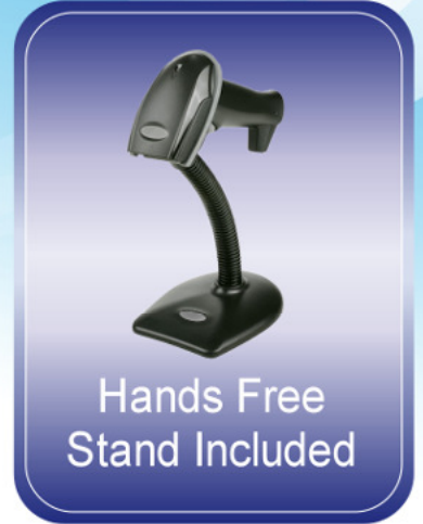
Hands Free Stand Included