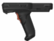
Pistol grip version