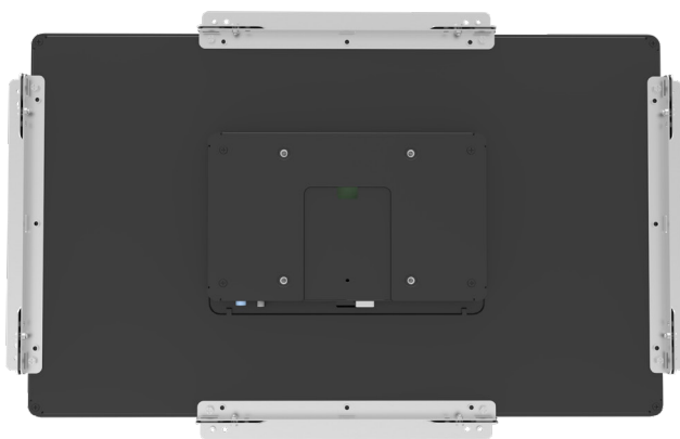
OPTIONAL MOUNT BRACKET

With 10 point multi touch display and I/O's including HDMI, Display Port, VGA and USB, the M22-OF is suitable for many applications and multi roles such as Digital Signage Display / Information Display, Self-Check In and Self-Check Out, or Self-Service Terminals (Self-Ordering).