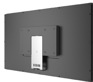
VESA MOUNT 100 X 100MM