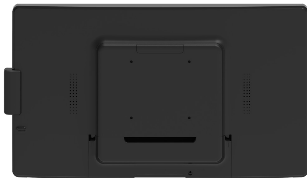
SLIM, DURABLE DESIGN

With a sleek slim design (37.9mm width) the fanless J1900 CPU, noise-free Panel PC is capable of multi roles such as Kitchen Video System (KVS), Self-Check In and Self-Check Out, Self Service Terminals (Self Ordering), or act as Digital Signage Display / Information Display.